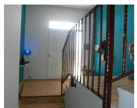
Benitachell (Benitachell/Benitatxell) / Villa