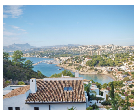
Moraira (El Portet) / Villa