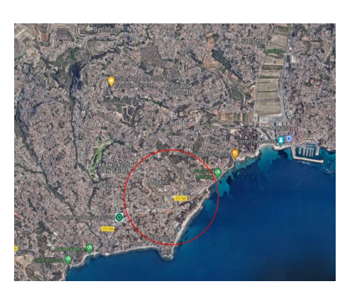
Moraira (Moravit) / Land